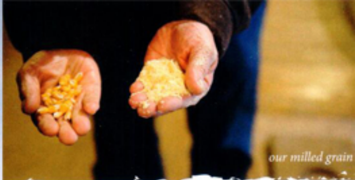
our milled grain